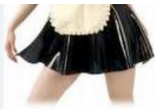
Angel Clothing - Fetish Clothing & Fetish Footwear